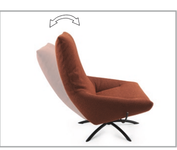
Comfortable rocking function, lockable via a laterally mounted hand lever