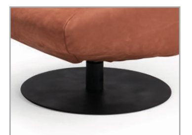
Optionally with base plate or...