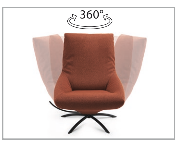
360° rotation function