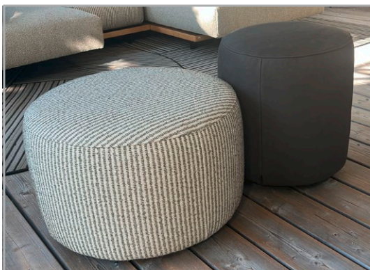
Available in two sizes