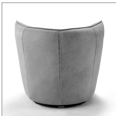
Decorative zipper, back side