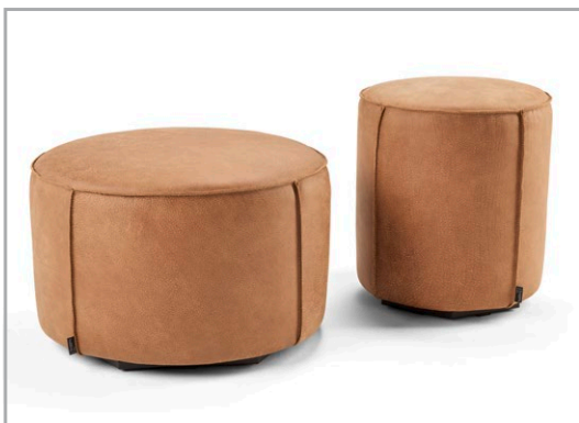
Available in two sizes