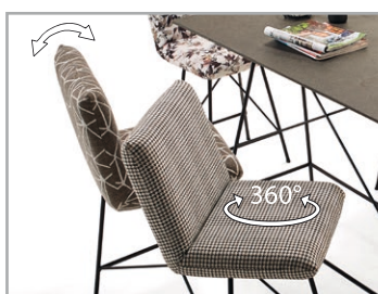
Rotation function (360°) and individual back adjustment