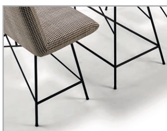
Filigree base frame, metal, powder-coated fine structure in black matt