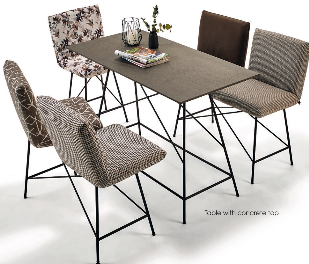
Table with concrete top