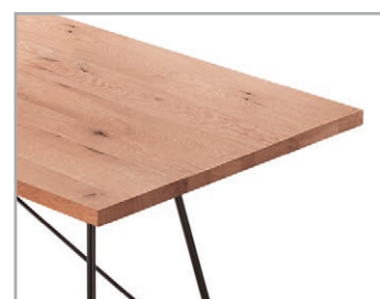
Quality outdoor solid wood in different wood variants or concrete table top